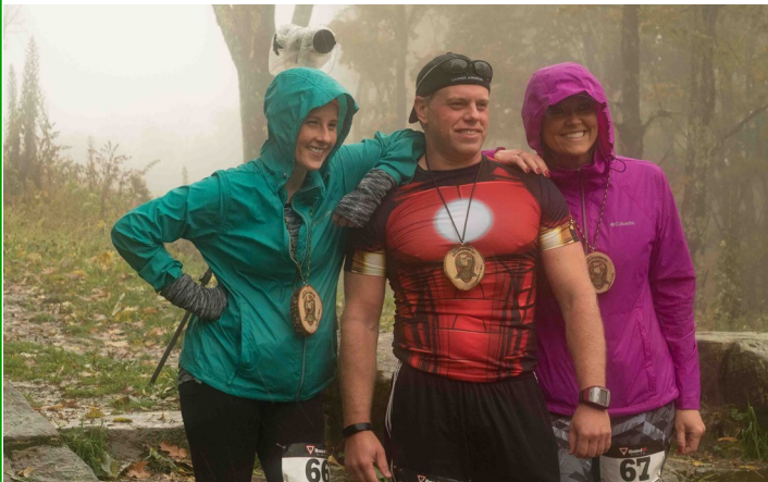
10k runners with finisher awards